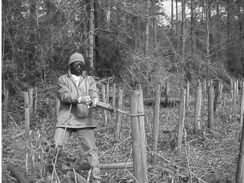
Example of 50 lb Pull test

The data from the evaluation was statistically analyzed using a variety of techniques (including assuming a Weibull lifetime distribution and calculating 90% confidence intervals at the 60 th percentile) and the results illustrate typical life spans for many of the preservative treated pine posts. The typical treated and untreated pine posts life span as approximated by the 60 th percentile can be seen in the Tables 2 and 3 and Figure 2.